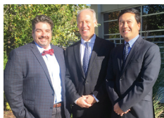
Milford • West Haven 203-878-2341