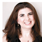
57 North St, #316 Danbury • 203-733-5999