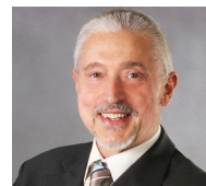
420 E Main St, #12 Branford • 203-488-5586