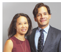
New Haven & Guilford 203-562-7662